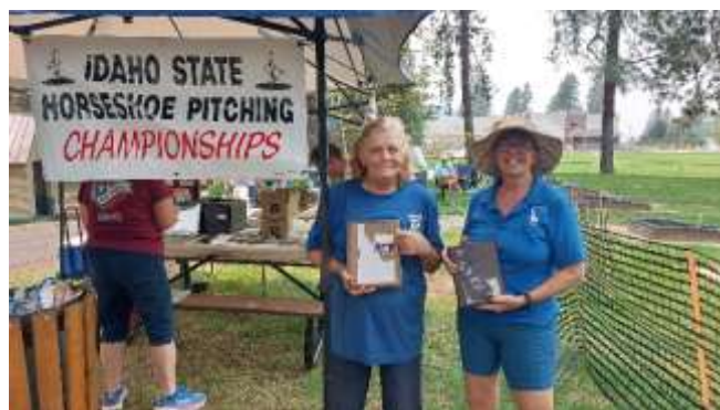
Champ Women Class