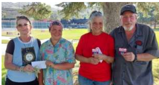
Class B Winners