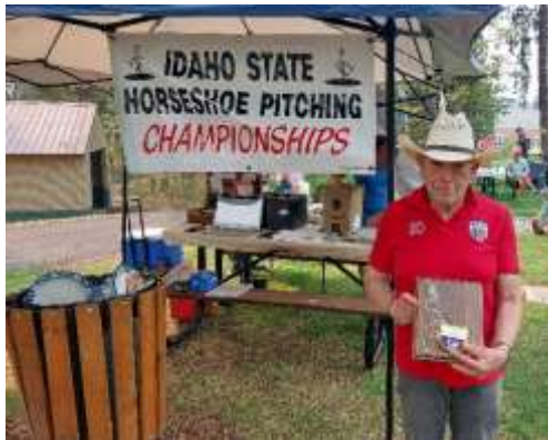
Elder Men Champ