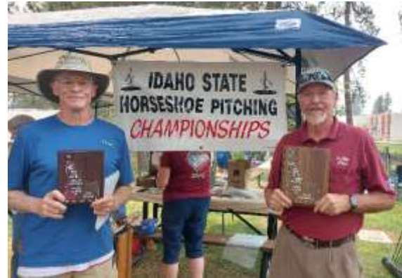
Men Class B