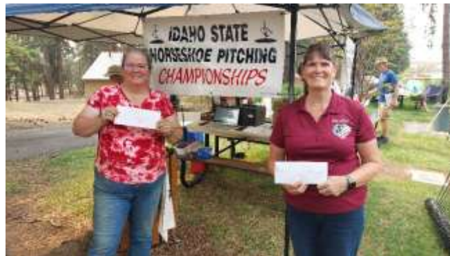
Class B Women