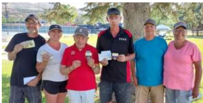
Class A Winners